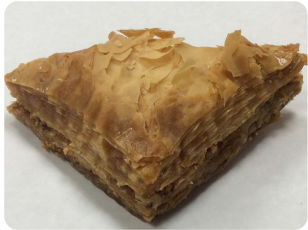
BAKLAVA - $2.99