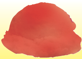
WATERMELON Sweet, juicy and seedless too!