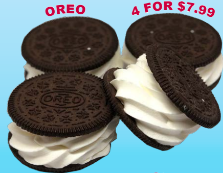
OREO 4 FOR $7.99