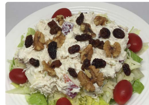
NEW! WALDORF SALAD

Grilled chicken breast, tomatoes, broccoli & pasta with parmesan cheese, served on a bed of lettuce