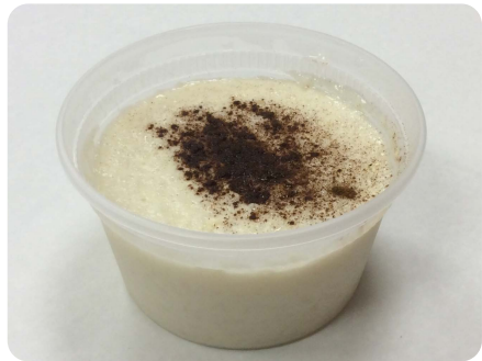
RICE PUDDING - $3.99