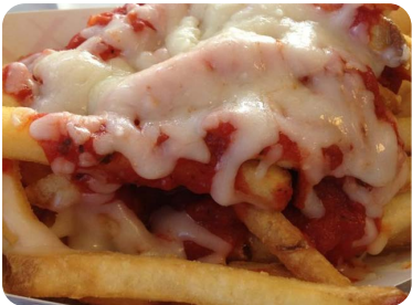
PIZZA FRIES - 5.99 with mozzarella & sauce