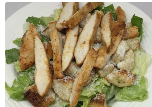
GRILLED CHICKEN CAESAR SALAD

Fresh crispy salad mix, tomatoes, cucumbers, green peppers, red onions, hard boiled egg, topped with our delicious marinated grilled chicken