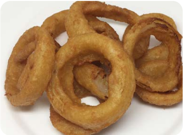
BEER BATTERED ONION RINGS - 5.99