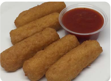
MOZZARELLA STICKS (5) with marinara - 6.99