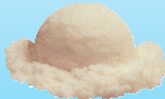
VANILLA BEAN A combination of creamy vanilla ice cream and loads of real crushed vanilla bean

REGULAR 8 oz ..... 3.99 LARGE 12 oz ..... 4.99 QUART 32 oz ..... 8.99