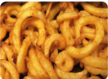
CURLY FRIES - 5.99