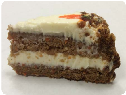
CARROT CAKE - $4.99