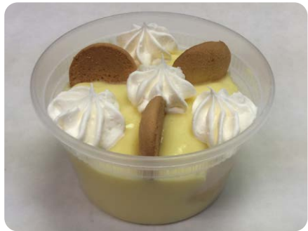
BANANA PUDDING - $3.99