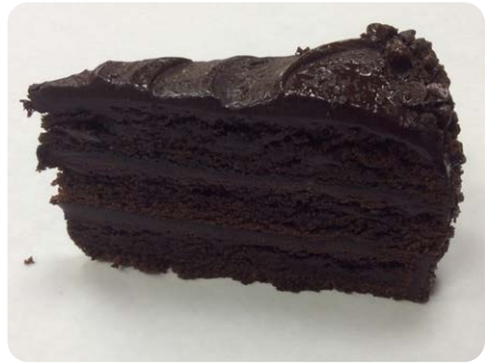
CHOCOLATE FUDGE CAKE - $4.99