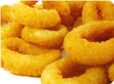
ONION RINGS - 4.99