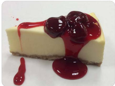
STRAWBERRY CHEESECAKE - $4.49