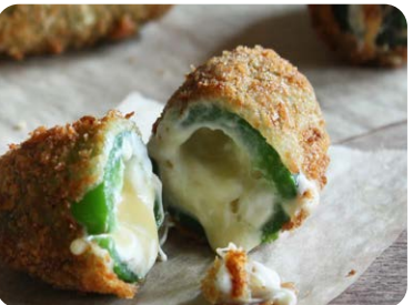
JALAPENO POPPERS (5) with cream cheese - 6.99