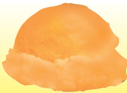
MANGO A delicious fruity, tangy, smooth orange ice.

KID'S ..... 2.99 REGULAR 10 oz ..... 3.99 LARGE 16 oz ..... 4.99 QUART 32 oz ..... 7.99