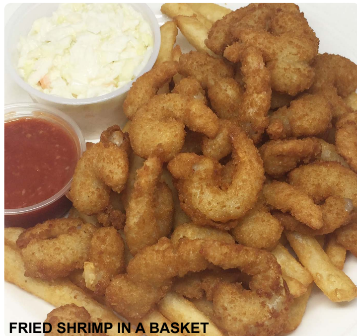
FRIED SHRIMP IN A BASKET