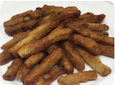
EGGPLANT FRIES 5.99