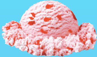
STRAWBERRY Strawberry ice cream with strawberry pieces and a strawberry swirl