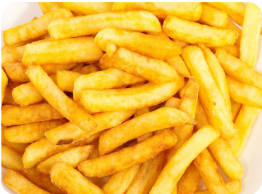
FRENCH FRIES - 3.99