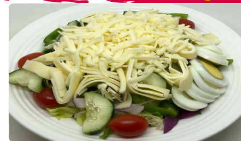
ASSORTED CHEESE SALAD

Fresh crispy salad mix, tomatoes, cucumbers, green peppers, red onions, hard boiled egg, topped with a breaded chicken cutlet