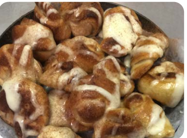
CINNAMON KNOTS (15) with icing - 7.99

SERVED ON YOUR CHOICE OF WHITE, WHEAT, OR RYE BREAD WITH LETTUCE, TOMATOES & POTATO CHIPS