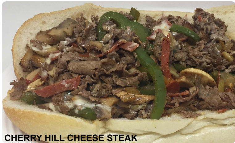
CHERRY HILL CHEESE STEAK