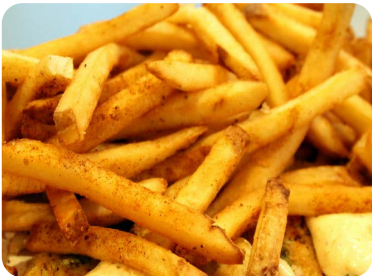
OLD BAY FRENCH FRIES - 4.99