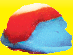
RAINBOW Cherry, lemon & blueberry. Red, white and blue, an all American treat.