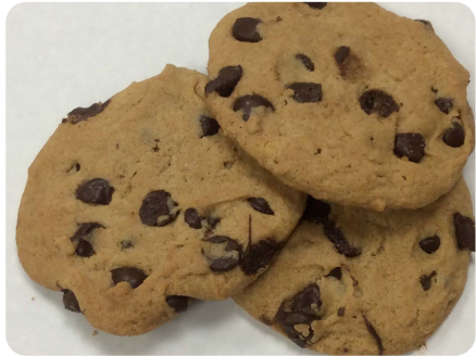
CHOCOLATE CHIP COOKIES - 3 FOR $2.99