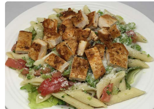
CHICKEN PASTA SALAD

Fresh crispy salad mix, topped with grilled chicken, hard boiled egg, mozzarella cheese, bacon and diced tomatoes