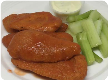
BUFFALO FINGERS (5) - 9.99 with bleu cheese & celery