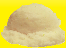
LEMON Made with Real Lemons. It's a Popular refreshing Treat!