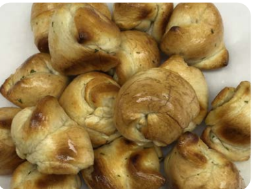
GARLIC KNOTS (15) - 5.99 Garlic butter & parmesan cheese