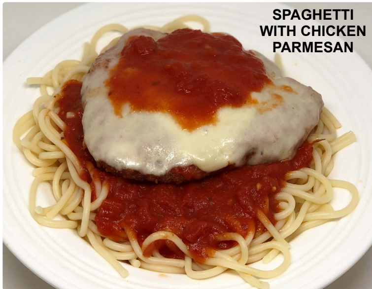
SPAGHETTI WITH CHICKEN PARMESAN