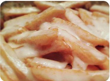
MOZZARELLA FRIES 5.99