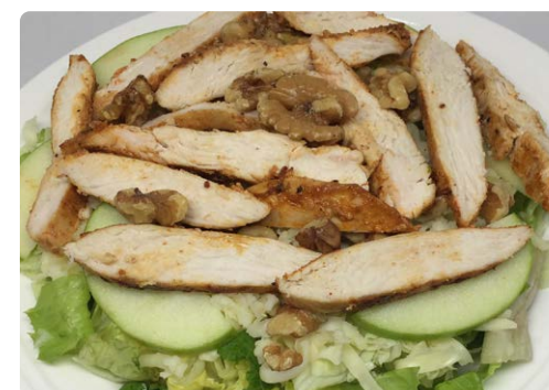
APPLE WALNUT SALAD

Fresh baby spinach topped with marinated grilled chicken breast, feta cheese, grape tomatoes, crispy bacon, sliced carrots and red onions