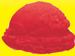
CHERRY Our most popular flavor. Tastes like you're biting right into a juicy cherry.