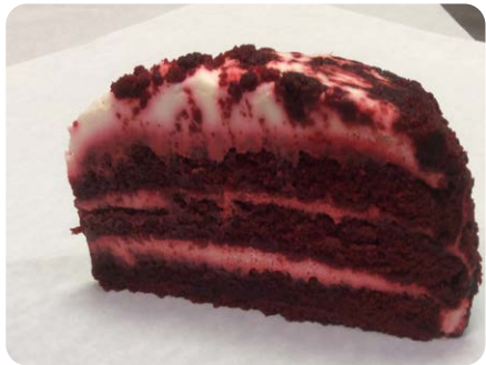
RED VELVET CAKE - $4.99