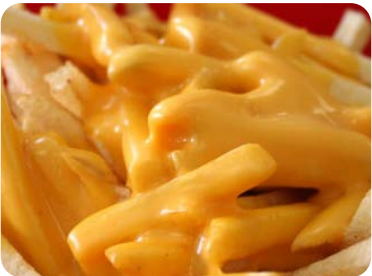
CHEESE FRIES - 5.99 with cheese wiz