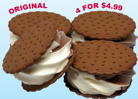
ORIGINAL 4 FOR $4.99

AVAILABLE ALL YEAR • DELIVERY OR PICK UP HOMEMADE ICE CREAM SANDWICHES