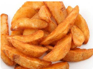
SEASONED BATTERED POTATO WEDGES - 5.99