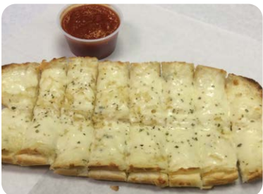
CHEESY BREAD - 4.99 with marinara