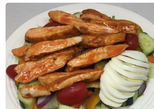
BUFFALO CHICKEN SALAD

Fresh crispy salad mix topped with our famous grilled chicken, croutons and parmesan cheese.