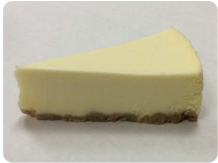
PLAIN CHEESECAKE - $3.99