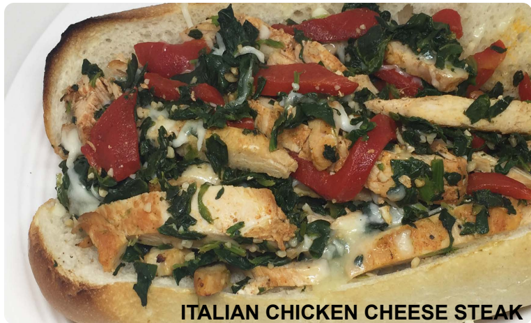
ITALIAN CHICKEN CHEESE STEAK