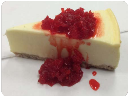
CHERRY CHEESECAKE - $4.49