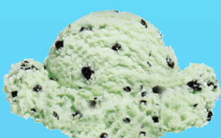
MINT CHOCOLATE CHIP Light green ice cream with chocolate morsels