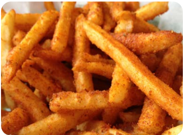
CAJUN FRIES 4.99