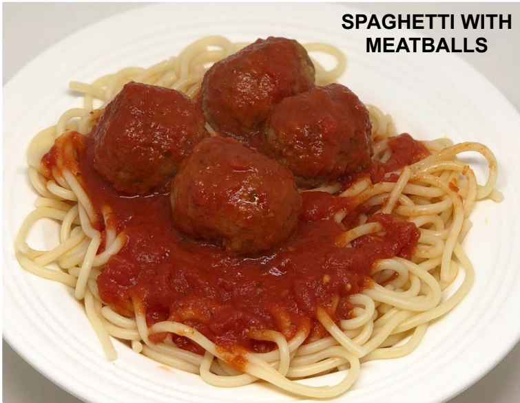
SPAGHETTI WITH MEATBALLS