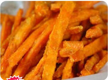
NEW SWEET POTATO FRIES - 5.99