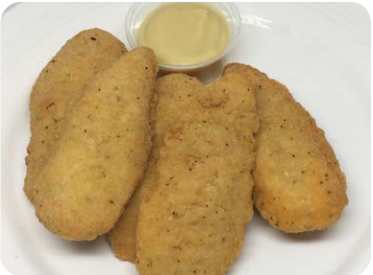
CHICKEN FINGERS (5) - 7.99 with honey mustard