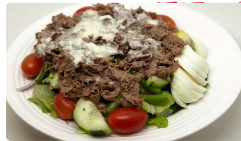
NEW! STEAK SALAD

Fresh crispy salad mix, tomatoes, cucumbers, green peppers, red onions, hard boiled egg, topped with our famous Philly steak with American cheese