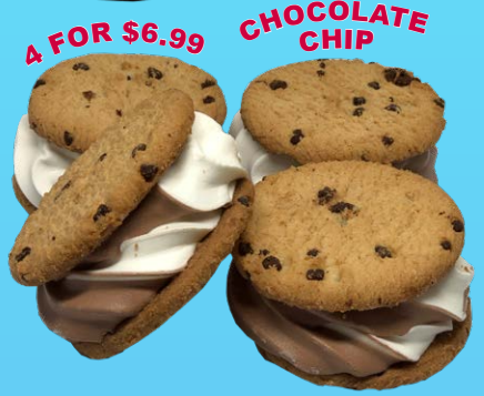
4 FOR $6.99 CHOCOLATE CHIP

FUNNEL CAKE FRIES Served with Powdered Sugar