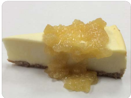
PINEAPPLE CHEESECAKE - $4.49