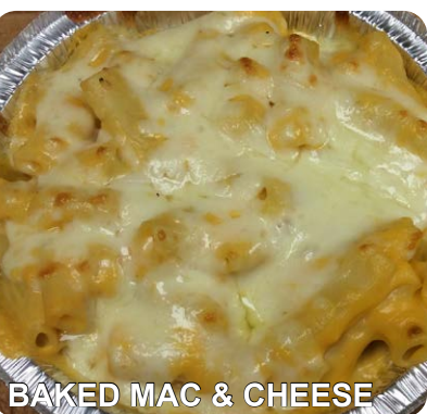
BAKED MAC & CHEESE