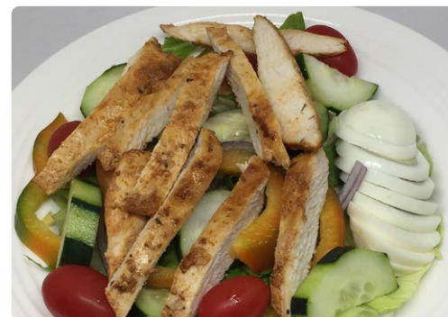
MARINATED GRILLED CHICKEN SALAD

Fresh crispy salad mix, tomatoes & mozzarella cheese topped with homemade chicken salad, walnuts, rasins & red apple