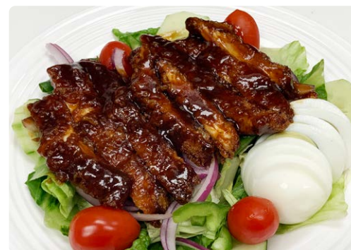
NEW! HONEY BBQ CRISPY CHICKEN

Fresh crispy salad mix, tomatoes, cucumbers, green peppers, red onions, hard boiled egg, topped with grilled chicken, mixed with our famous hot sauce