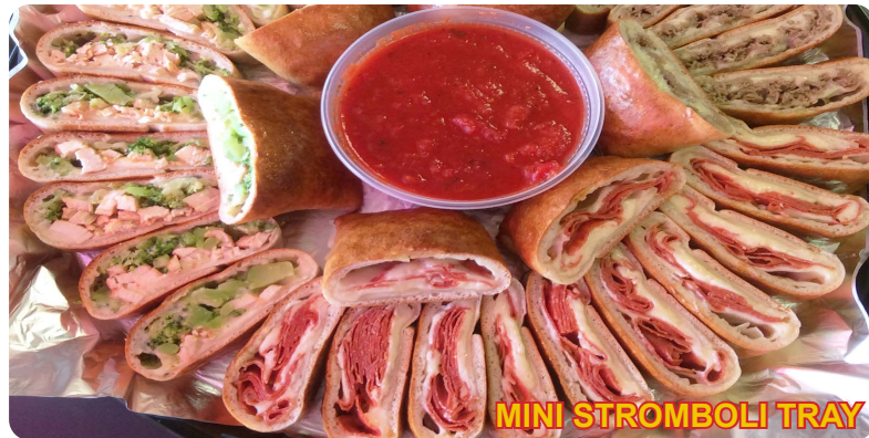
MINI STROMBOLI TRAY