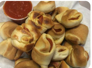
PEPPERONI KNOTS (15) with marinara - 7.99