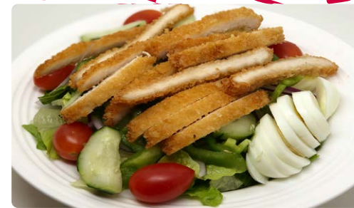
CRISPY CHICKEN SALAD

Fresh crispy salad mix, tomatoes, cucumbers, green peppers, red onions, hard boiled egg, topped with our famous Philly steak with American cheese