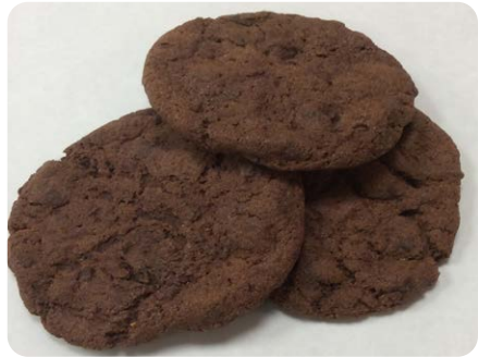
DOUBLE CHOCOLATE CHIP COOKIES - 3 FOR $2.99